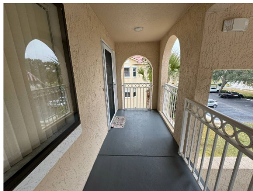
GENERAL VIEW OF BUILDING'S FINISH