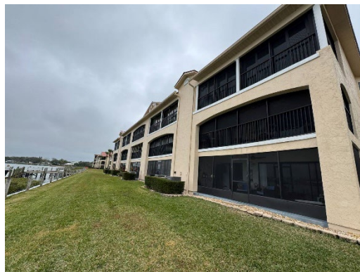
GENERAL VIEW OF PROPERTY