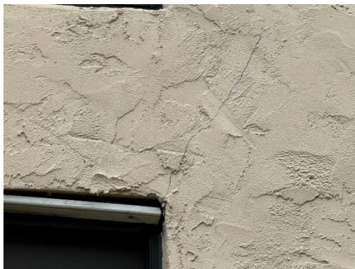
View of Stucco cracking at the edge of balcony.