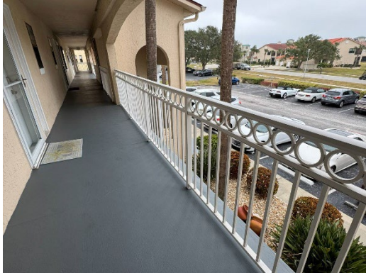
GENERAL VIEW OF TYPICAL ELEVATED WALKWAY