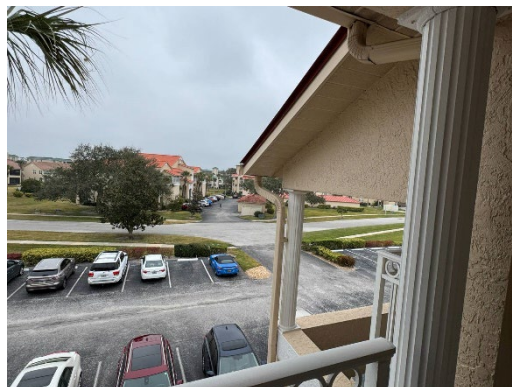
GENERAL VIEW OF PARKING