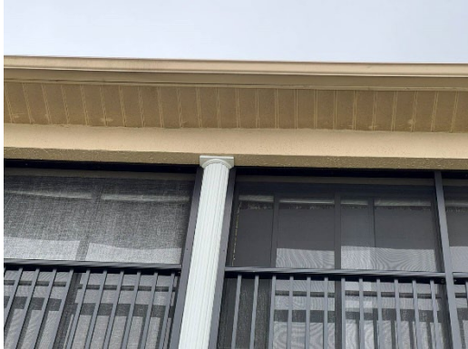
GENERAL VIEW OF BUILDING'S FINISH