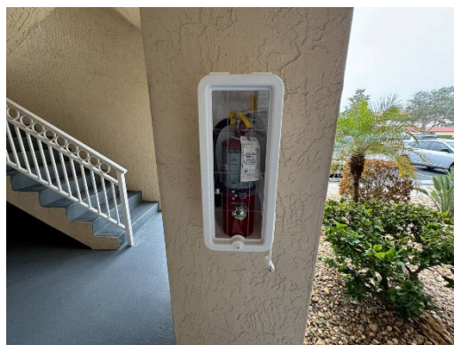
GENERAL VIEW OF FIRE EXTINGUISHER