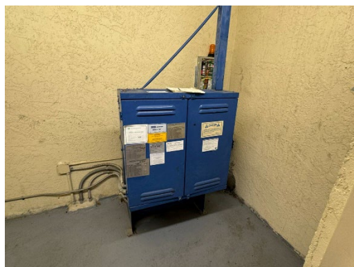
GENERAL VIEW OF ELEVATOR EQUIPMENT